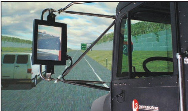
Two LCD screens simulate the rear view from the truck cab