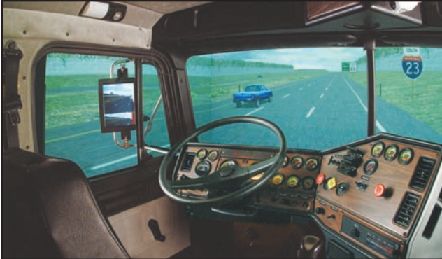
Fully operational cab, with real working instrument panel, gauges and controls