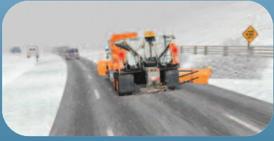
Simulate environmental factors, such as adverse weather.