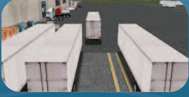
Practice collision-avoidance techniques while backing.