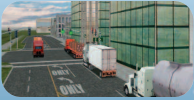
Recognize and anticipate hazardous driving situations in difficult and common city environments.