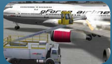
Recognizing collision points with aircraft and no-spray zones

MPRI 333 South Main St, Suite 200 Ann Arbor, MI 48104 Tel: 734.995.1967 www.mpri.com/gforce