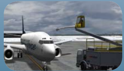
Practice spraying techniques