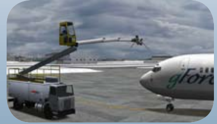
Understand driving patterns required in congested deicing pads

This material is MPRI general capabilities information and does not contain any controlled technical data as defined within the International Traffic in Arms Regulations (ITAR) or Export Administration Regulations (EAR)